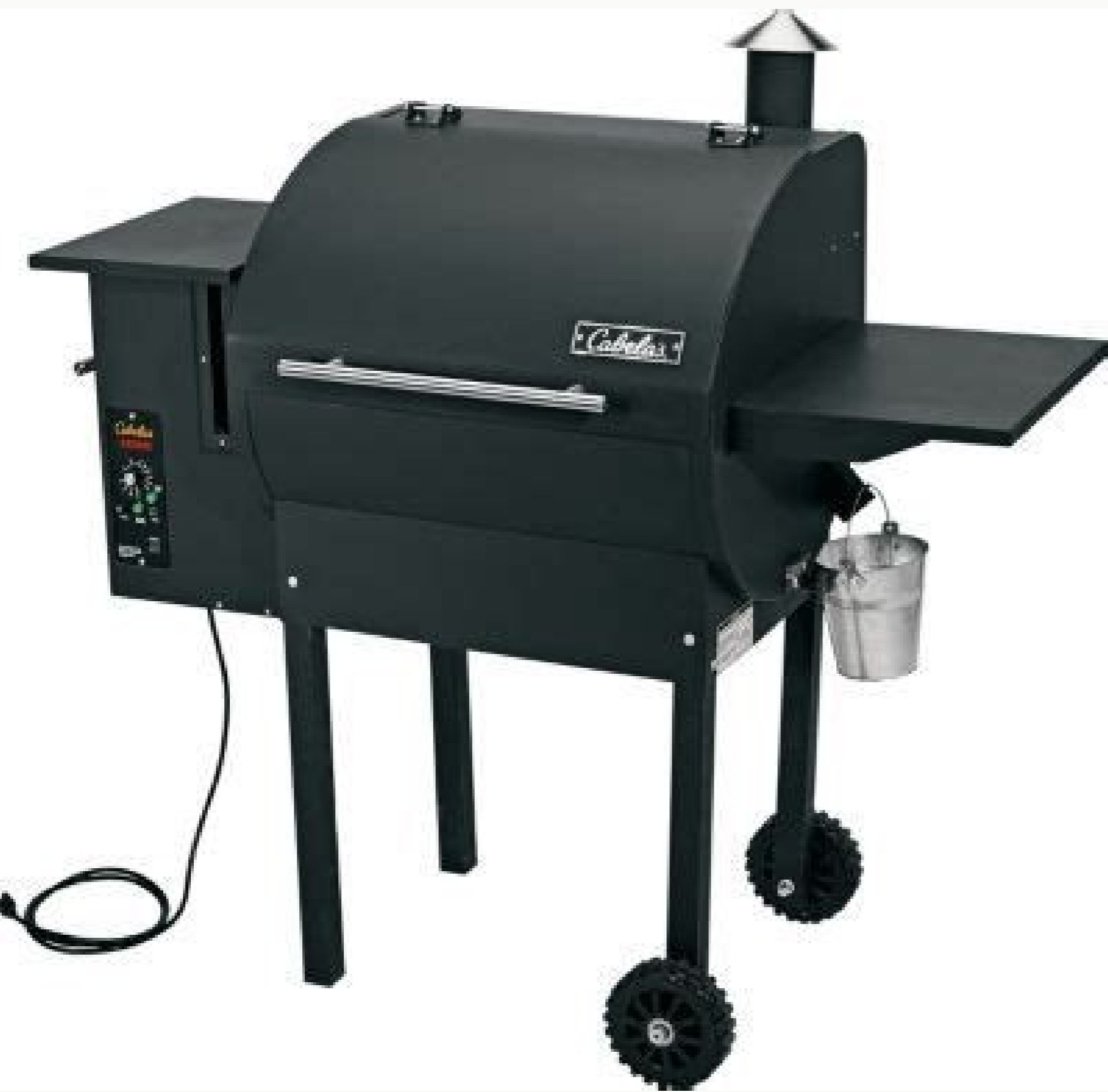
Cabela's pro series 24 elliptical pellet grill manual.